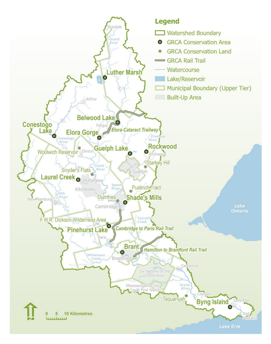
Figure 1 Map of Grand River Conservation Areas, rail trails and some Conservation Lands within the Grand River watershed.