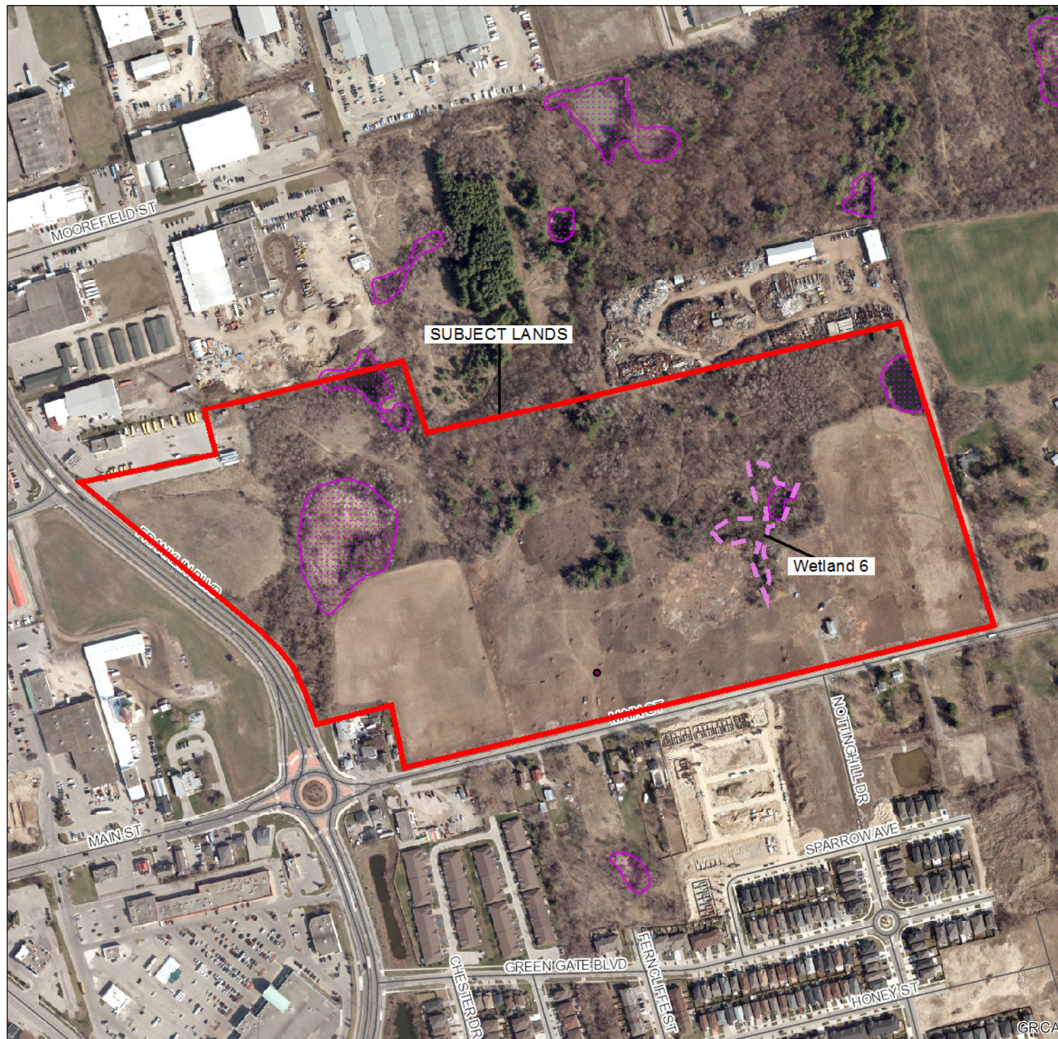
Figure 1: Wetland 6 Location

Map Centre (UTM NAD83 z17): 558,021.61 4,801,128.40