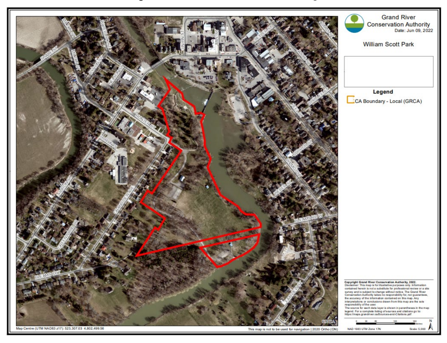
Figure 1 – William Scott Park, New Hamburg